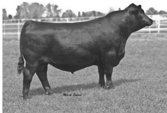
Sitz Investment 660Z Grand Sire of lot 34

ADG of 10. Out of a first calf heifer going back to our great 991 cow.