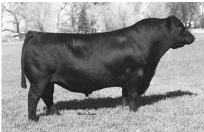
Effective 61 Sire of lots 15, 66, 67

Cowman's kind of bull. Moderate and you can keep the daughters.